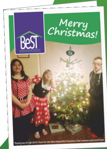
Thank you to our 2016 Hunt for the Most Beautiful Christmas Tree winners pictured here